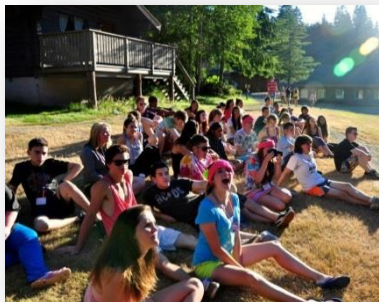
YES Leadership Camp

MEMBER-CLIENT SURVEY: We received 101 survey responses from members/clients in April. Over 96% of respondents reported that they were satisfied or very satisfied with our overall customer service.