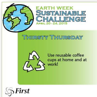
Earth Week Sustainable Challenge

EARTH WEEK CHALLENGE: The Member Service Team at Powell Branch challenged all staff to participate in the Earth Week Sustainable Challenge from April 20 – 24. Staff were challenged to do things like print double-sided, bring a waste-free lunch to work, and use reusable coffee cups.