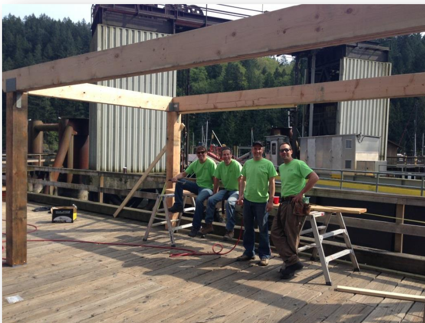
Memorial Welcome Gazebo, Construction Volunteers

DONATIONS & SPONSORSHIPS: Texada Arts, Culture and Tourism – Run the Rock ($1,000)