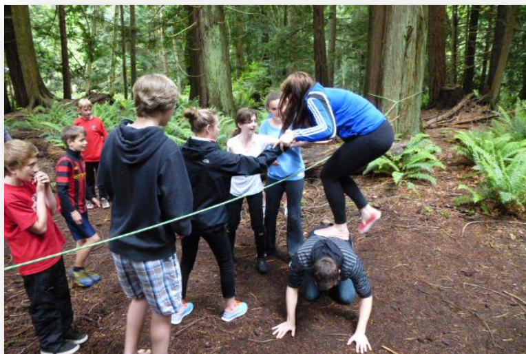
Leaders in Training Youth working on a team building exercise

Thanks to the First Credit Union funding, we are able to offer high quality leadership training, food, t-shirts and ongoing support, and opportunities for community engagement to Bowen Youth all at no charge to families. Not only will the funding allow our program to expand, but this partnership strengthens our resources. We are also excited to have First Credit Union's VP of Communication and Culture deliver a leadership workshop here on Bowen! Thank you First Credit Union for your investment in Bowen youth!